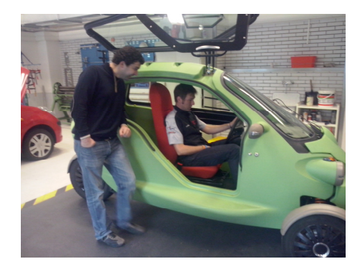
Impressions from the last partner meeting in Düsseldorf at the FJBK in April 2015